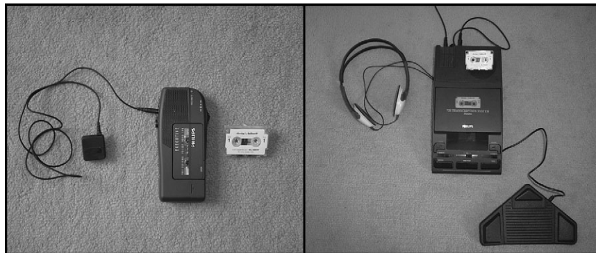
FIGURE 1 Analogue audio recording equipment: dictaphone with microphone and mini-cassette tape and foot-pedal controlled transcription machine with headphones

Transcribing is an interpretive act rather than simply a technical procedure, and the close observation that transcribing entails can lead to noticing unanticipated phenomena. It is impossible to represent the full